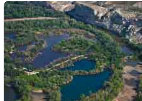
FRONT Ebro River